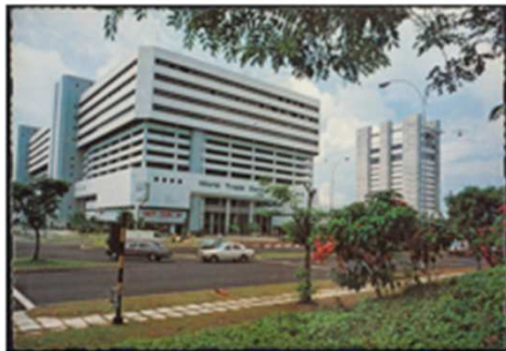
1980年シンガポール日通 重機建設支店 設立

In line with our global rebranding, we are now known as “NX Global Engineering Pte. Ltd.” (hereinafter NXGE)