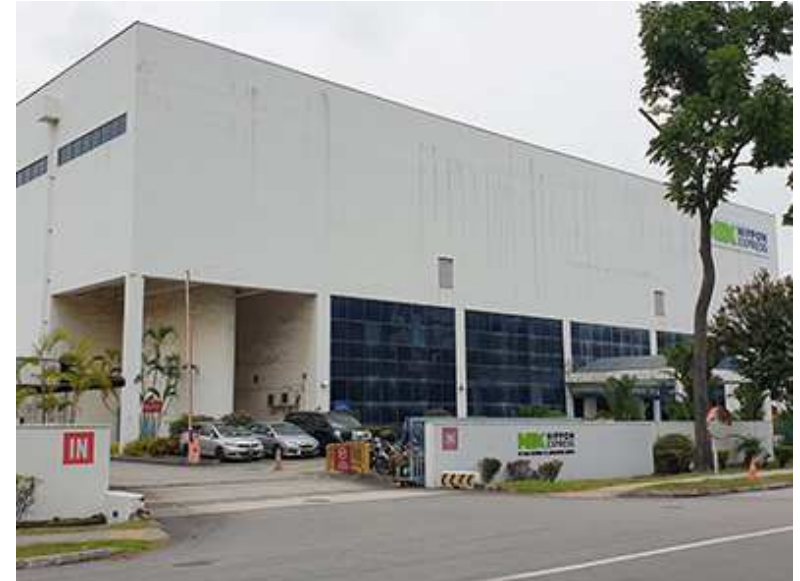
Photo of Office & Workshop

Total : 205 pax (Including Daily Operation & Maintenance)